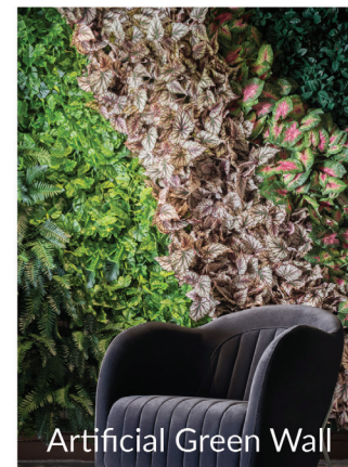
Artificial Green Wall