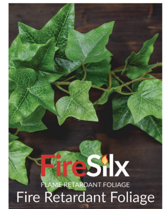
Fire Retardant Foliage

Find Out More WWW.TREELOCATE.COM INFO@TREELOCATE.COM